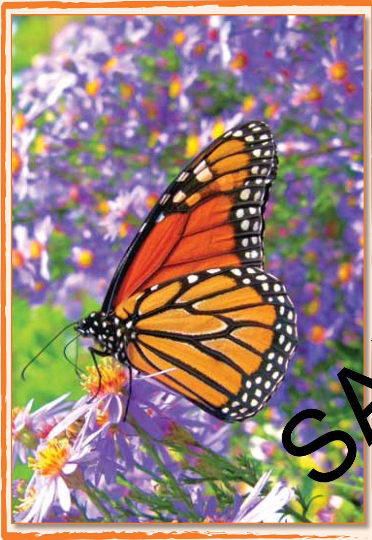
It will soon be a mother.