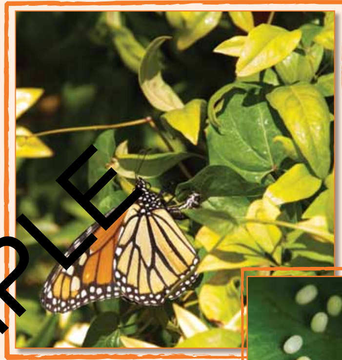
The mother butterfly lays eggs.