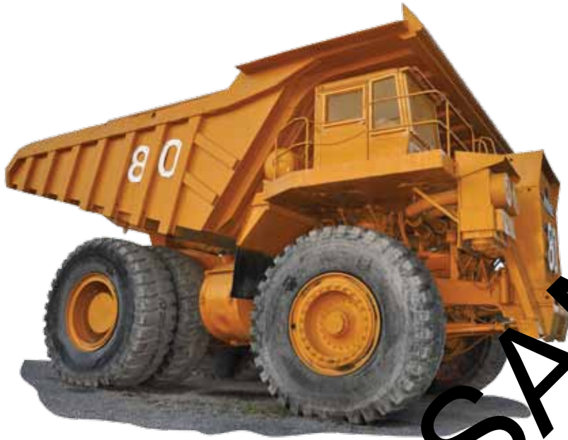
This is big.