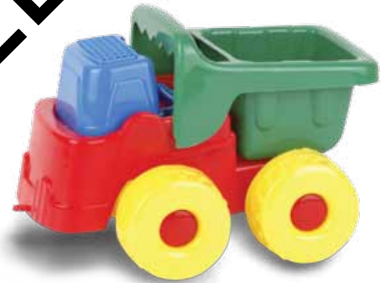
This is little.